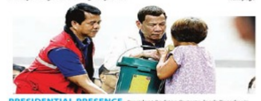
PRESIDENTIAL PRESENCE. President Rodrigo Duterte leads Tuesday in distributing family food packs to victims of the Taal Volcano eruption during his visit at the Batangas City Sports Coliseum.

"We love our horses... that's why we wanted to save them," he added. The creatures can generate $7 each per trip up to the stunning panoramic views above the volcano's main crater, a significant sum in a nation whose million survive on less than $2 a day. Next page