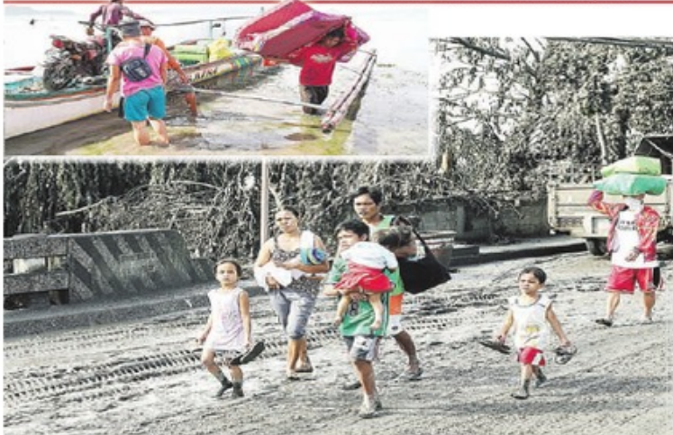
BAREFOOT BUT BRAVE. Highly strung evacuees trudge along the heavily silted muddy road towards Tanauan City (above) after unloading their valuables, while edgy residents at the foot of Taal (inset left) unload their belongings from an outrigger canoe while the volcano spews ash as seen from Tanauan on Monday. Elsewhere, in Laurel town, residents clean their mud-covered roofs of their homes (inset right)—with authorities warning Wednesday there might be hazardous eruption in the next few days.