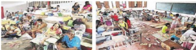
EAGER EVACUEES. Distressed residents (from left) of Barangay Sampaloc, Talisay Batangas are worried sick and shooting bullets in a gym, as are those evacuated at the PUP campus in Santo Tomas, Batangas from Barangay Baradera, while evacuees from other towns affected by the eruption rest at an evacuation center in Tanauan town, also in Batangas.